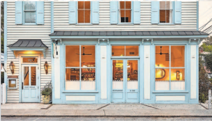
POST HOUSE INN Mount Pleasant, S.C.