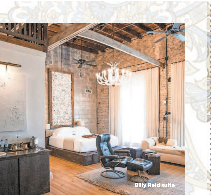
Billy Reid suite