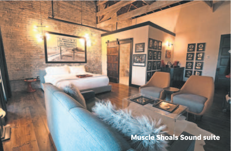
Muscle Shoals Sound suite