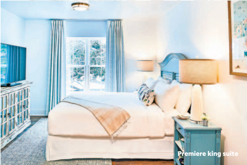
Premiere king suite