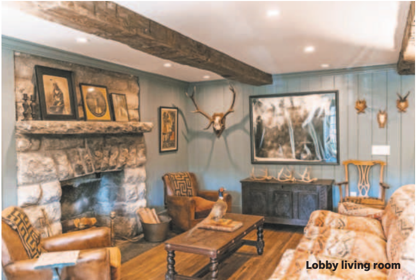
Lobby living room