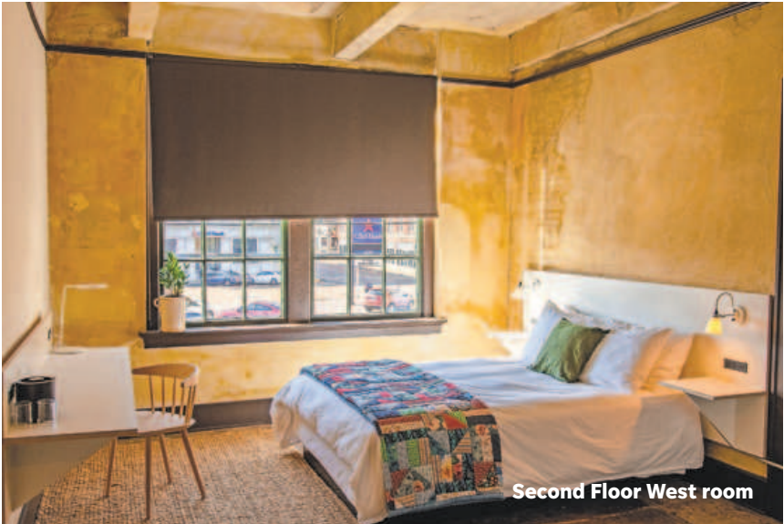
Second Floor West room